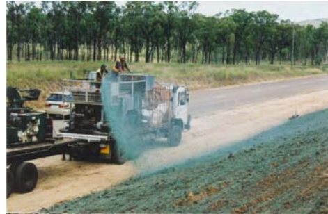
Cane BFM being applied at IECA (Australasia) field day in Townsville.

BFM products must be applied in at least two layers from different directions to minimise "shadowing".