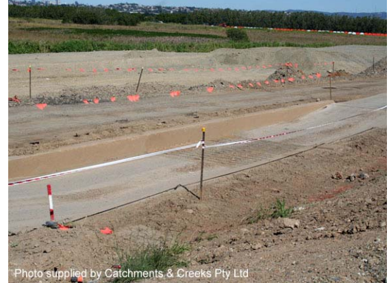
Photo 6 – Wash bay operating as a dry vibration grid during dry weather