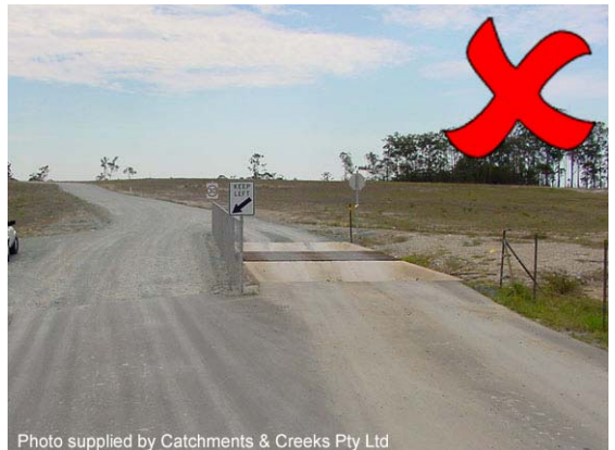
Photo 8 – Dividing site entry and exit lanes can result in vehicles bypassing the construction exit

Efficiency is highly variable and depends on the design of the wash bay.