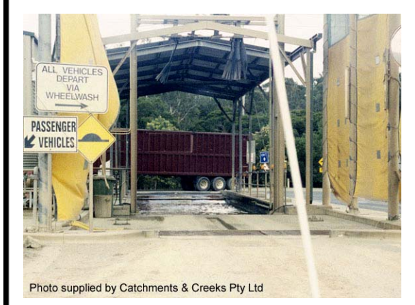
a land fill site