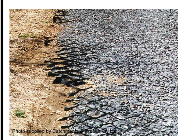
Photo 1 – Cellular confinement system used to restrict gravel movement on a permanent car park

[2] Can be used for short-term erosion control, but is most commonly used as a permanent treatment.