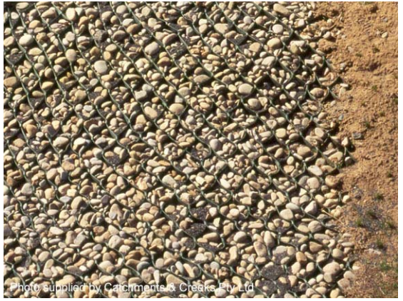
Photo 8 – Cellular confinement system used to hold aggregate on an embankment