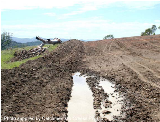
Photo 8 – Flow diversion bank down-slope of a future pipeline installation