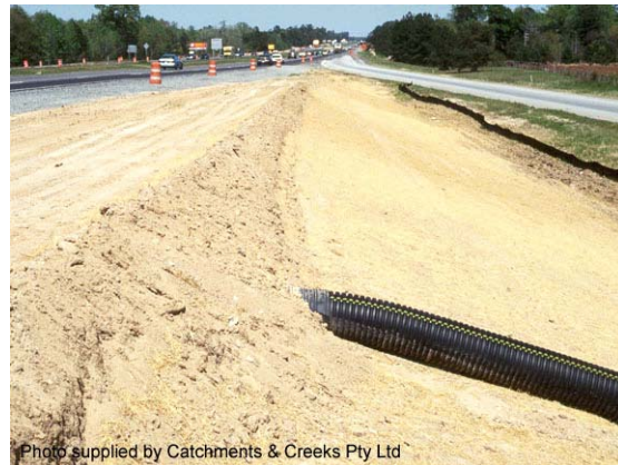
Photo 9 – Earth flow diversion bank used to direct runoff towards the Slope Drain