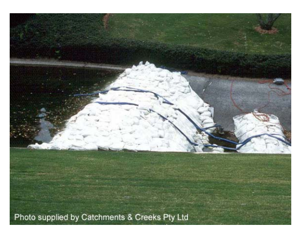
Photo 1 – Upstream sandbag cofferdam located within a concrete channel during channel maintenance