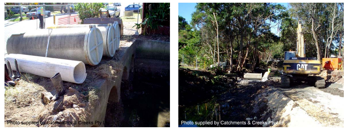
Photo 3 – Flood bypass pipes with attached tide gates prior to their installation shown right

In tidal waters, tide gates may be required to allow storm/flood flows to discharge through the downstream cofferdam (Photos 3 & 4).