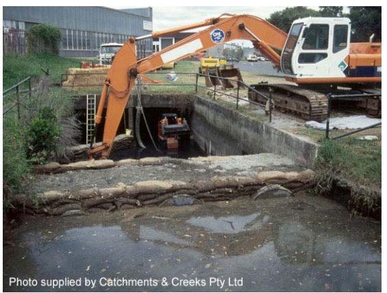
Photo 2 – Downstream sandbag and compacted fill cofferdam located within a storm drain during drain maintenance